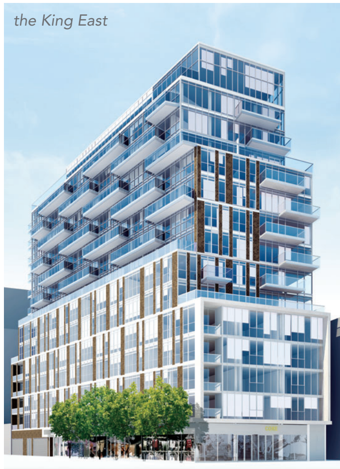
the King East

In addition to these incredible changes, a new condo project “Bauhaus” has just launched at Sherbourne and King Street East. At the nearby St. Lawrence Market, four major new projects are in various stages of development (VÜ, Market Wharf, London on the Esplanade, and L Tower). Concert Properties is planning a new major development at Church and Front Street East. This huge population of the St. Lawrence Market area feeds the retail stores along King Street East. Downtown East has changed