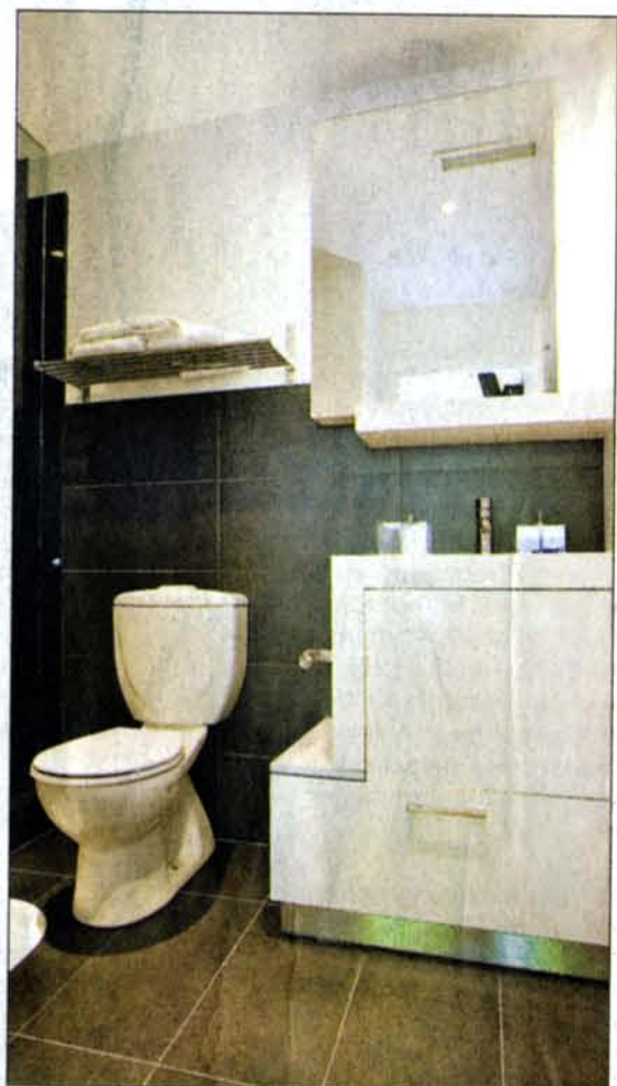
Left, the den sits just beside the front door. Above left, the Scavolini kitchen is sleek with matte-finish cabinetry that extends into the living area. Warm tones are even carried into the bathroom, above.