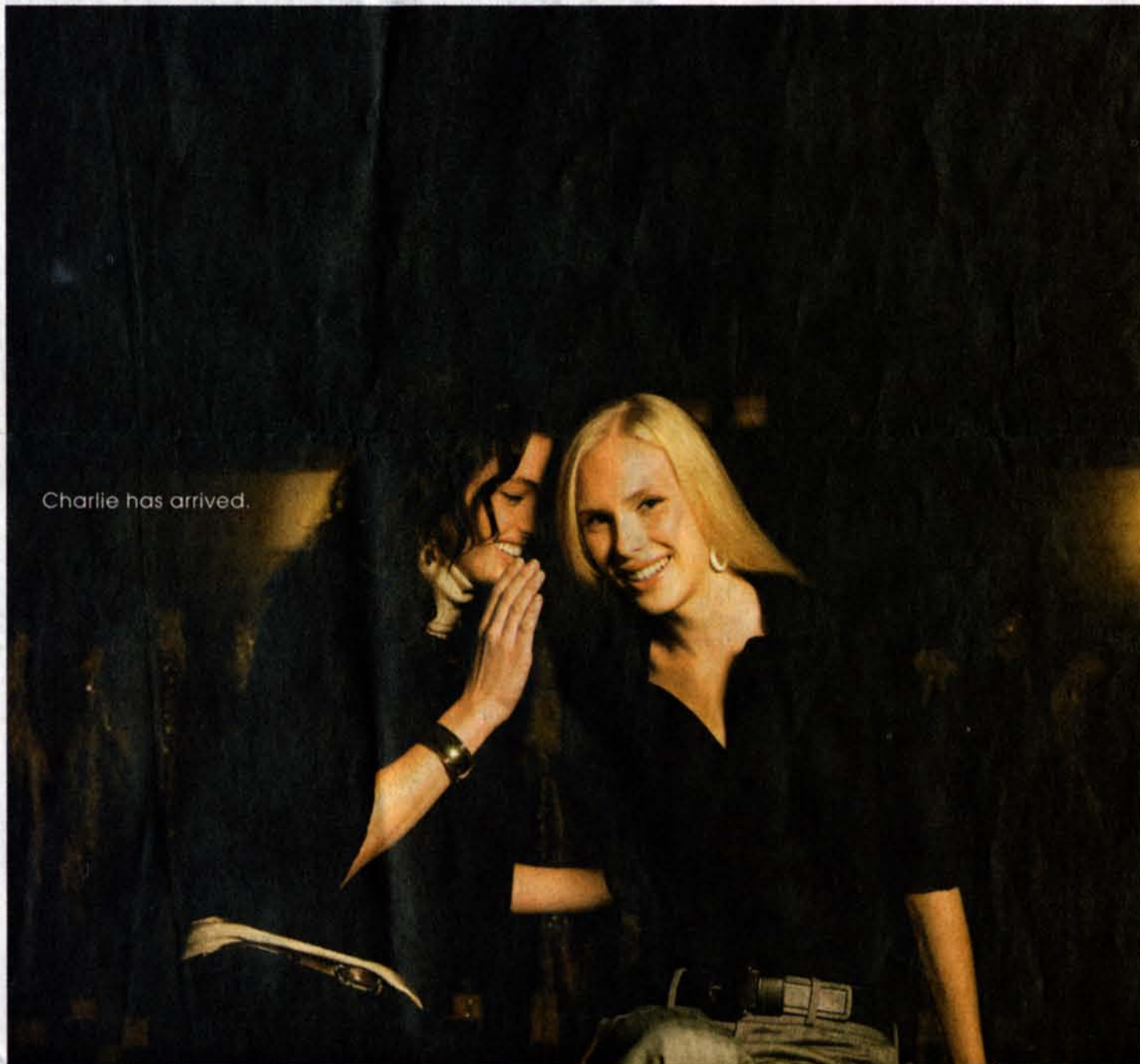
Charlie has arrived.

PROJECT: Leslieville Lofts BUILDER: Hyde Park Homes and Lamb Development Corp. DESIGNER: Bryan Chartier, Core Architects LOCATION: Broadview Ave. and Queen St. E. SIZE RANGE: 470 square feet to 2,265 square feet PRICE RANGE: $179,000 to $599,000 SITE AMENITIES: A green roof, party room, concierge, fitness room, guest suite, landscaped area, Autoshare at the building, Queen St. streetcar SALES OFFICE: 136 Broadview Ave.; Mon./Thurs. 12 p.m.-6 p.m.; Tues. 3 p.m.-8 p.m.; Wed./Fri. closed; Sat./Sun. 12 p.m.-5 p.m.; 416-203-6262; leslievillelofts.com OCCUPANCY DATES: Summer 2010